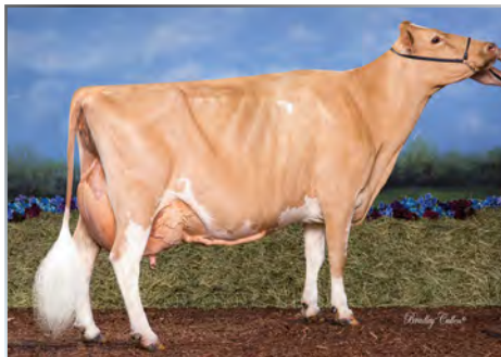
GOLDEN GATE JUDGMENT KNIGHT KOALASKNIGHT Judgment x Thomas

KOALASKNIGHT is an exciting young A2/A2 'Judgment' son from the one and only Queen of the Breed, 'Florando SD Koala-EX94'.