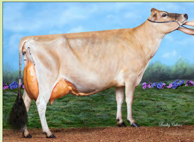
Dam: Cairnbrae Valentino Daisy 2 EX93. Honourable Mention Champion Jersey IDW 2019