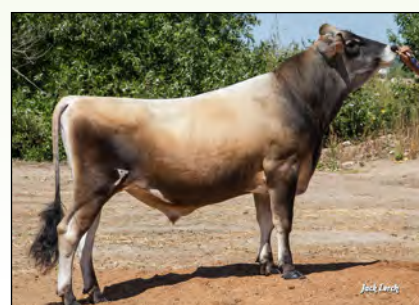
Ahlem Craze Doc 24061-ET