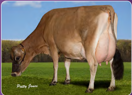
PERSEUSMAN Action Daughter