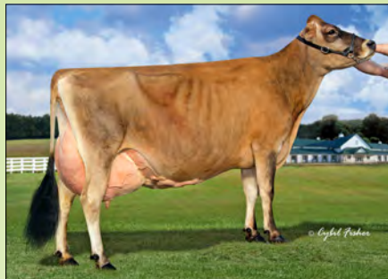
MGD: Hawarden Jace Pix EX95