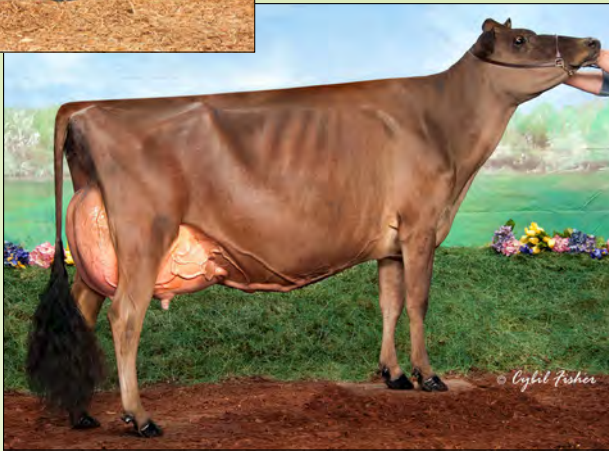
Payneside Mac N Cheese VG89-2YR