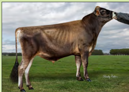
Diamond Hill Oliver Pixstar P-ET