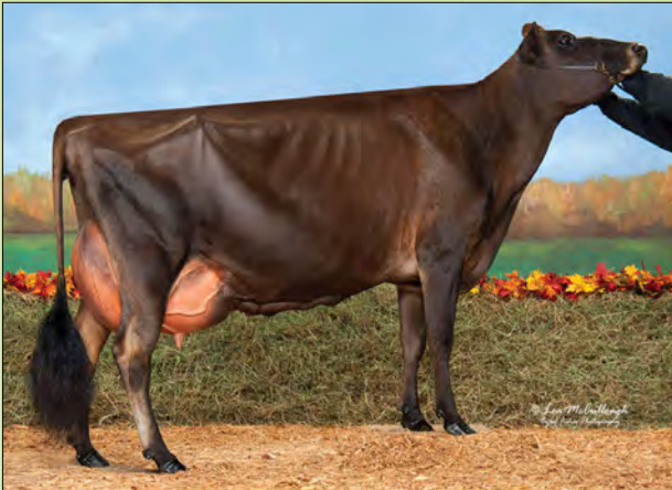
Arethusia Tequila Vision EX94