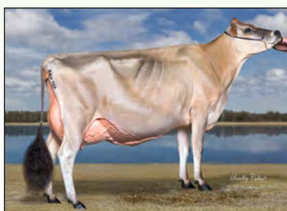
Miami Elton Girlie 4588