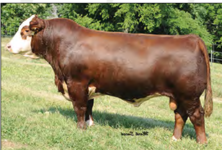
BOYD MASTERPIECE 0220