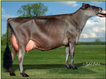
Edgebrook Tequila Madison EX91

Sire: GIL-BAR SPARKLER PRIMETIME Dam: PLEASANT NOOK SAMBO TEAL - EX94 305D 19,040M 5.2% 990F 3.5% 662P (lbs) MGS: LESTER SAMBO MGD: PLEASANT NOOK REGAL TEAL - VG87 305D 17,540M 5.3% 923F 3.5% 615P (lbs)