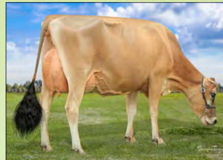
Dam: Diamond Hill Chrome Pixel - ET VG87