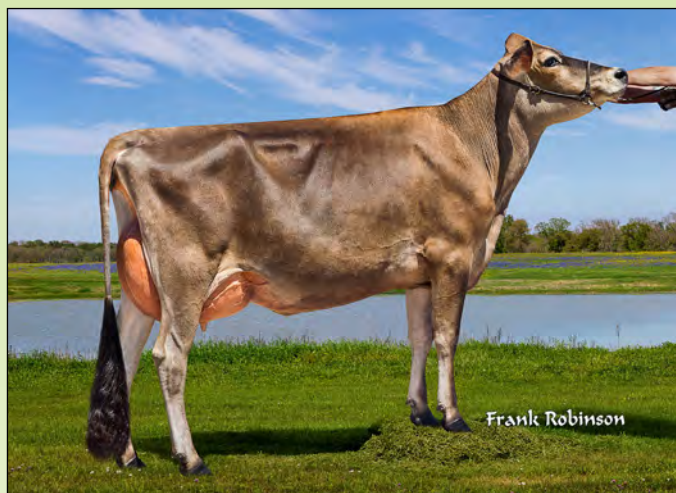
Dtr: BW Citation Marta VG87

Sire: ALL LYNN'S VALENTINO IRWIN - ET Dam: BW CENTURION PEGGY K798 - EX92 305D 25,550M 5.2% 1327F 3.3% 833P (lbs) MGS: SOONER CENTURION - ET MGD: BW AVERY SUZANNE ET 119 - ET EX90 305D 24,100M 5.0% 1195F 3.3% 797P (lbs)