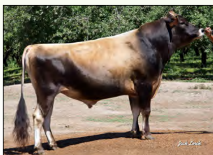
BW Citation A-ET