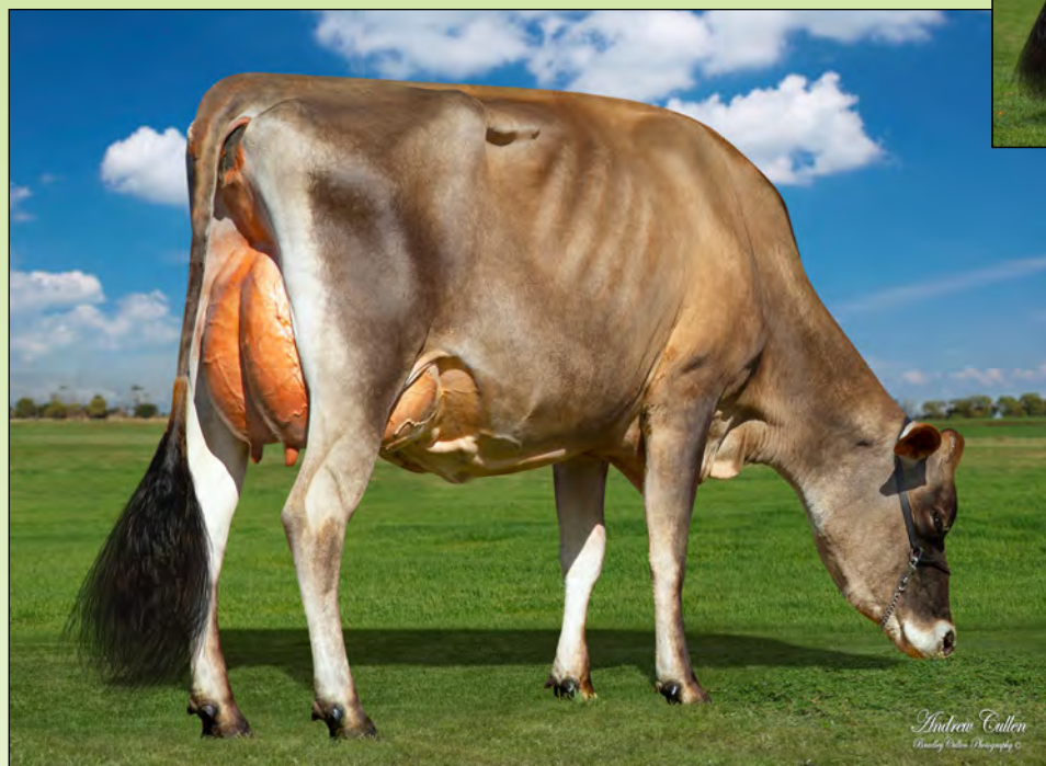
Daughter: Jamber Bontino Lady 87 @ 2yrs

Sire: ALL LYNN'S LOUIE VALENTINO - ET Dam: CAIRNBRAE TBONE ESTELLE - ET EX93 305D 5,038M 5.5% 279F 3.7% 188P (kgs) MGS: RICHIES JACE TBONE A364 MGD: CAIRNBRAE ALFS ESTELLE 93 - VHC93 305D 5,754M 6.2% 357F 4.4% 252P (kgs)