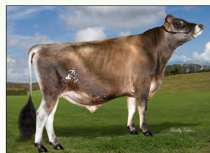
Cairnbrae Top Gun