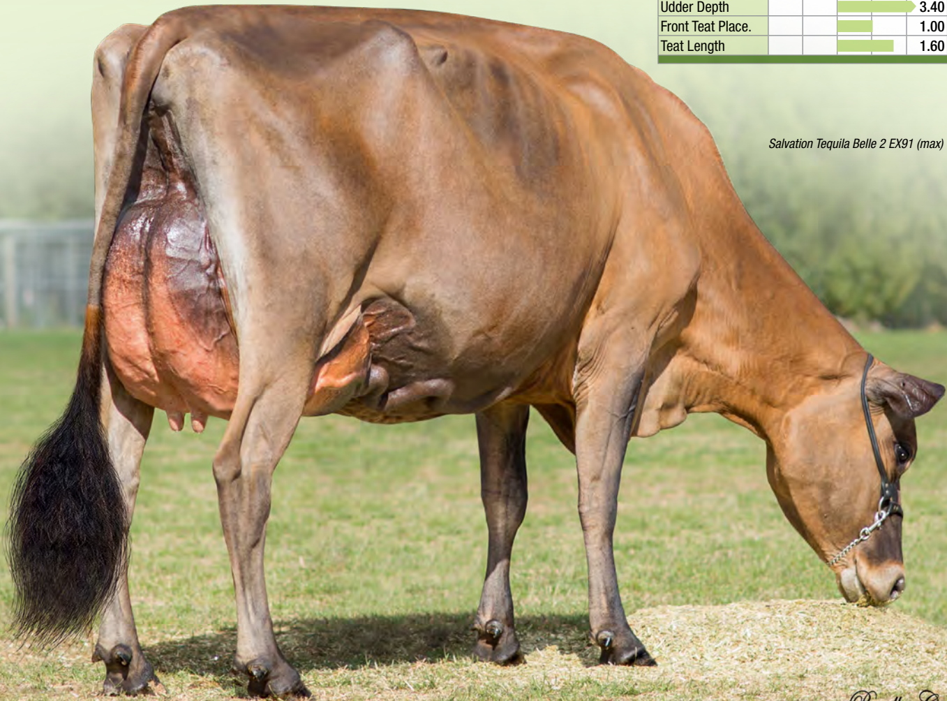
Salvation Tequila Belle 2 EX91 (max)