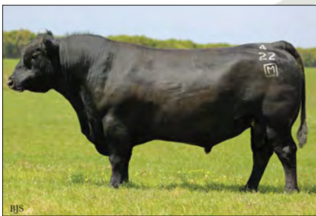
PATHFINDER COMPLETE K22