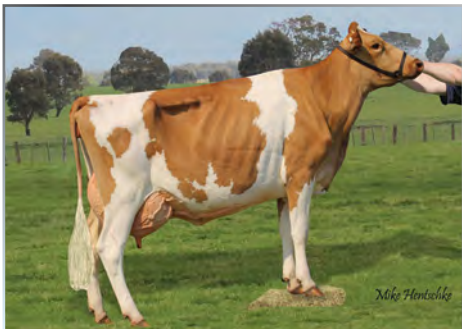
GILBERT BELLMAN BELLMAN Legend X BosGeo

Bellman's maternal granddam is a full sister to Sunny Valley Tiller Bell EX90 and Tiller Bess EX both are multiple Senior Champions at Brisbane Royal. His dam boasts production and fat. Bellman is bred at the Gilbert's farm in WA. This herd and cow family are no stranger to the Guernsey breed.