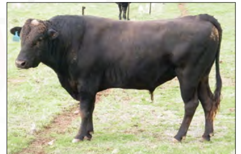
GOORAMBAT TERUTANI F146