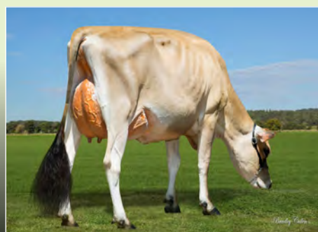
Daughter: Brookbora Love Lies 735