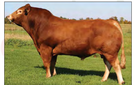
POSTHAVEN P ZANSIBAR – *HP