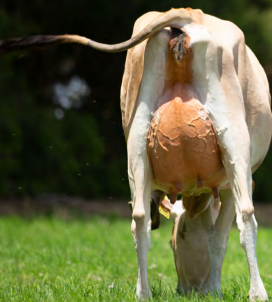
Daughter: Brookbora Love Lies 735