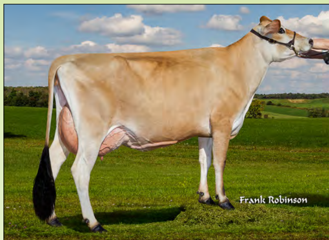
Dam: Ahlem Plus Dee 42868 EX90

Sire: RIVER VALLEY CIRCUS CRAZE-ET Dam: AHLEM PLUS DEE 42868 EX90 305D 21,250M 4.5% 955P 3.6% 758P MGS: SWEETIE PLUS IATOLAS BOLD MGD: AHLEM VALENTINO DEE 38548 VG86 305D 23,470M 4.6% 1071F 3.6% 852P