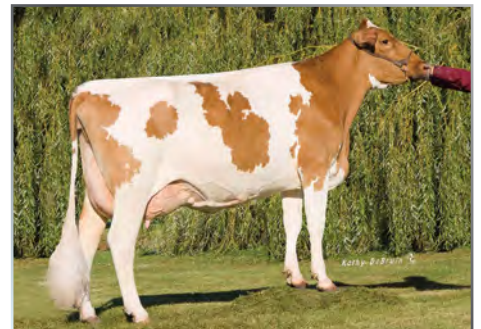
Lang Haven Alstar Navarro NAVARRO Alstar x Les

NAVARRO hails from the great Nicolette Family. He has what breeders are asking for – body depth, great feet & legs, fore udder and rear udders. Navarro will sire extreme health traits.