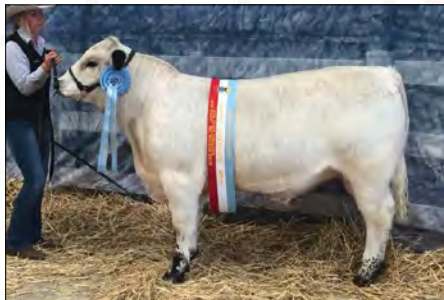
HANGING ROCK HALDOR