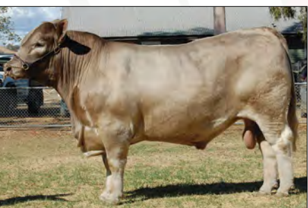
TARLINA COOMUNGA C57